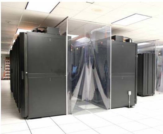
Figure 1. The Palmetto HPC infrastructure.