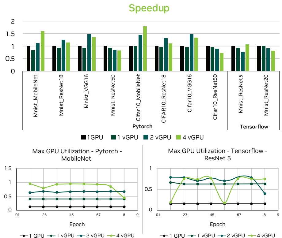
Figure 3. Performance comparisons between physical GPUs and virtual GPUs. Credit: Rong Ge and her students, Deep Learning on vGPUs: A Case for High GPU Utilization and Throughput.

In the test example (Figure 3) it should be noted that 1 GPU means one V100 32G physical GPU. 1/2/4 vGPU means configuring one V100 physical GPU as 1 V100-32Q, 2 V100-16Q, and 4 V100-8Q virtual GPU-enabled VMs. The subfigure on the left compares the relative speedup and the subfigure on the right compares the GPU utilization. As noted previously, these results show that running the same workload using four V100-8Q enabled VMs can speed up the benchmark by 1.6 times and increase utilization by four times.